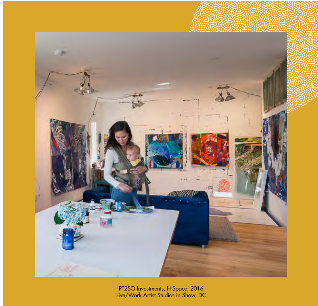
PT2SO Investments, H Space, 2016 Live/Work Artist Studios in Shaw, DC

CulturalDC sees the arts as a driving force in building sustainable communities across Washington, DC. We provide a wide range of programs and services that support artists' ability to live and work in the city. We give audiences access to affordable and accessible cutting-edge visual and performing art from artists living and working today. Since 1998, CulturalDC has brokered more than 300,000 square feet of artist space, including: the Arts Walk at Monroe Street Market, Atlas Performing Arts Center, GALA Hispanic Theatre, Source Theatre and Woolly Mammoth Theatre. In addition to providing space, we facilitate opportunities for and present innovative visual, performing and multidisciplinary artists. CulturalDC's Mobile Art Gallery is DC's first moveable artspace and a commitment to use art as a catalyst to build community. Each year, CulturalDC serves more than 1,000 artists and welcomes 40,000 audience members and participants who patron local businesses and contribute an estimated $1 million to the local economy.