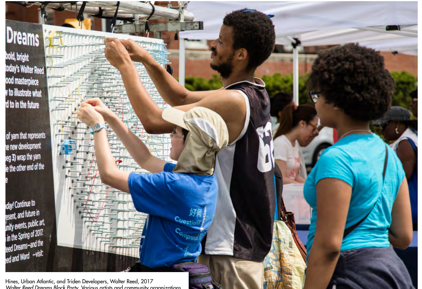
Hines, Urban Atlantic, and Triden Developers, Walter Reed, 2017 Walter Reed Dreams Block Party, Various artists and community organizations