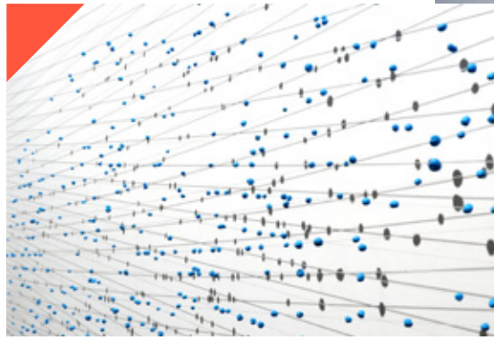
Night Sky detail from Juan Tejedor's Flashpoint Gallery exhibition Standing Atop the Ladder